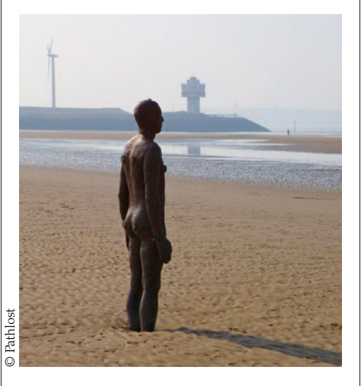
We feel like a society focused on moving forwards, not leaving enough time to reflect

I have outlined three further strategies for fostering a more connected